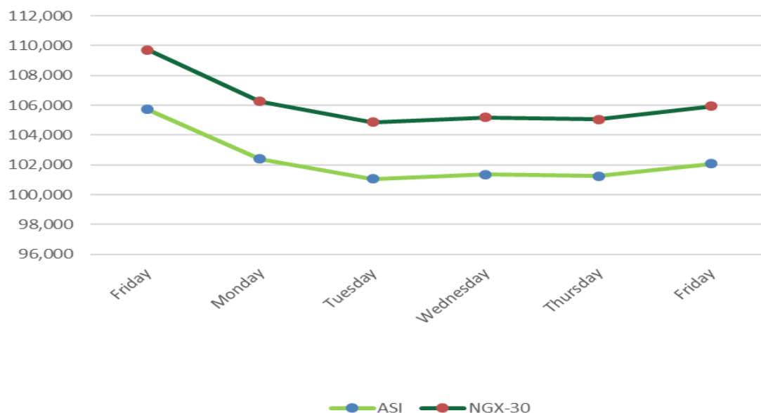
The NGX All-Share and NGX-30 Indices Week Ended February 23, 2024